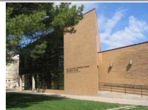
Eccles Conference Center

Professor, College of Agriculture Utah State University Logan, UT