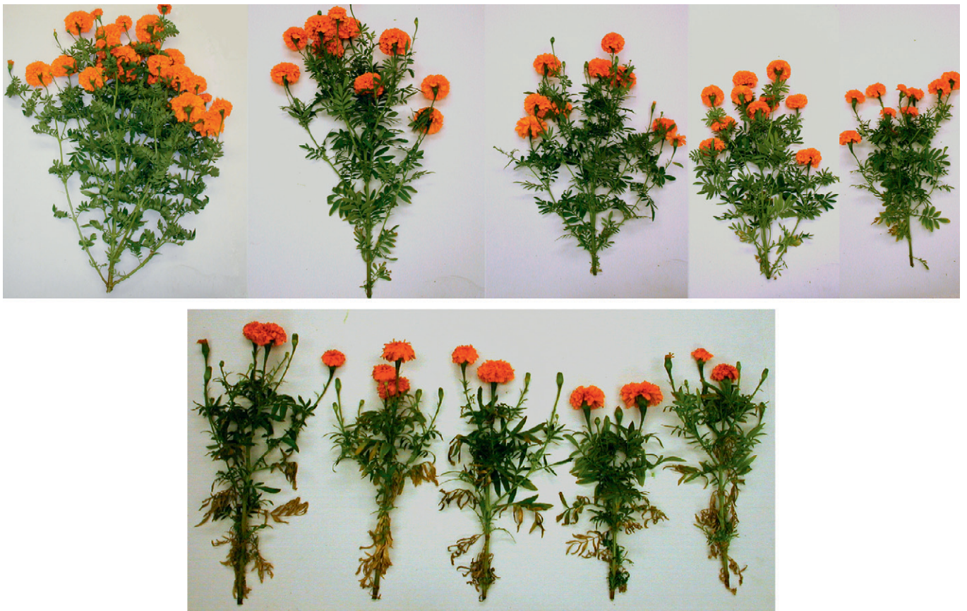
Fig. 4. Marigold Tagetes erecta 'Flagstaff' plants at experiment termination. From left to right, plants irrigated with water with electrical conductivities of 2, 4, 6, 8, and 10 dS·m -1 , respectively. Top plants were irrigated with water of pH 6.4 and bottom plants with water of pH 7.8.

'Yellow Climax' exhibited similar trends as 'Flagstaff' but appears to be more salt-tolerant. Shoot DW decreased by 24% and plant height decreased by 21% when EC w was 8 dS·m -1 . In addition, the total number of flowering shoots produced and flower diameter were not decreased significantly when EC w was lower than 8 dS·m -1 , suggesting that