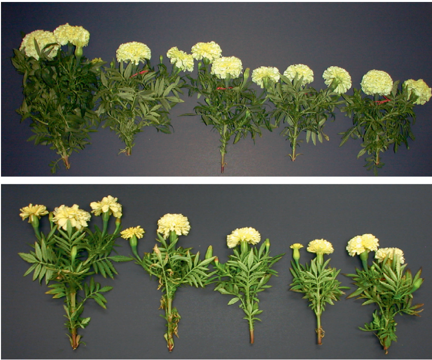
Fig. 3. Marigold Tagetes patula 'French Vanilla' plants at experiment termination. From left to right, plants irrigated with water with electrical conductivities of 2, 4, 6, 8, and 10 dS·m -1 , respectively. Top plants were irrigated with water of pH 6.4 and bottom plants with water of pH 7.8.

quality of cut flowers of both cultivars was also reduced by Day 7 when EC w was 6 and 10 dS·m -1 ; however, in 'Yellow Climax', quality of harvested flowers of plants irrigated with EC w 6 dS·m -1 was similar to that of control plants, suggesting a higher tolerance.