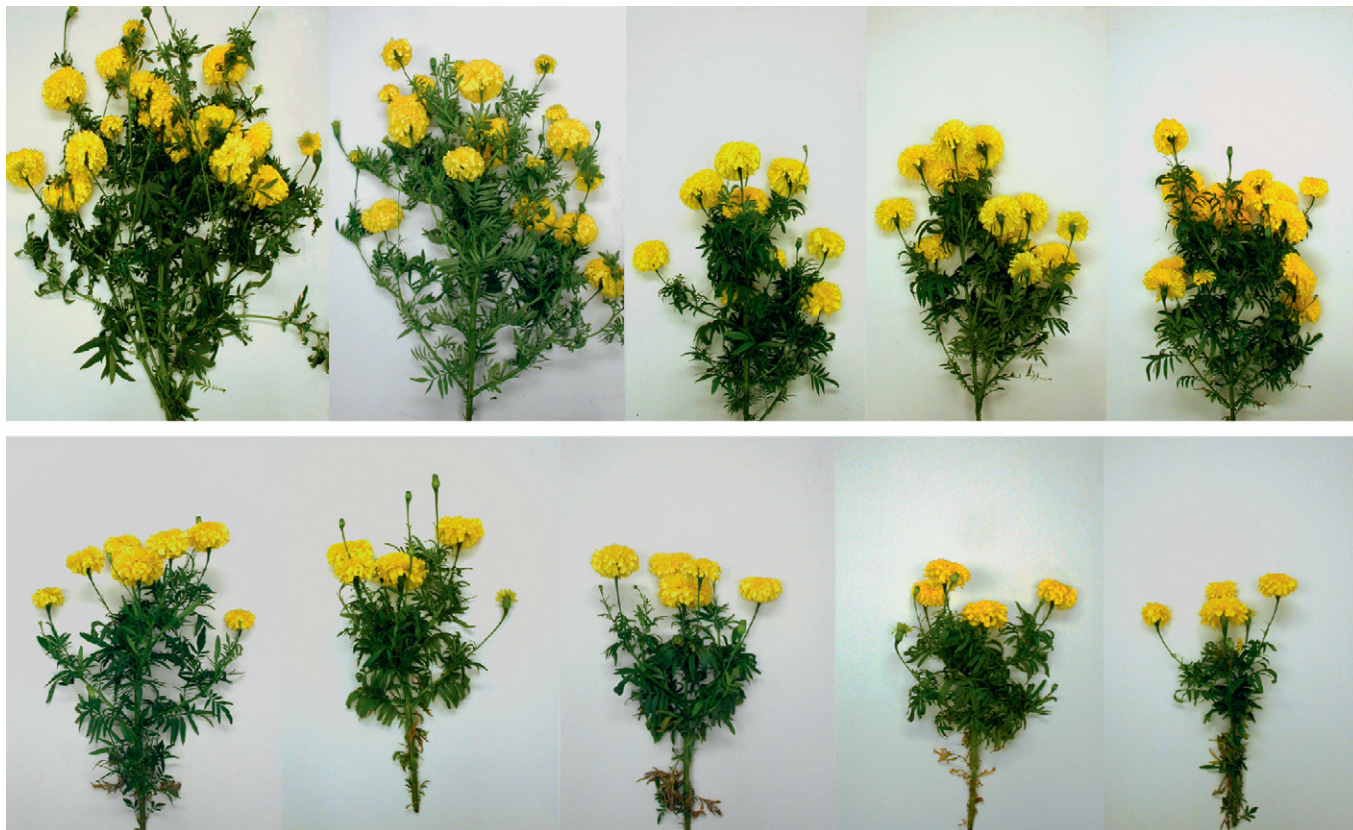
Fig. 5. Marigold Tagetes erecta 'Yellow Climax' plants at experiment termination. From left to right, plants irrigated with water with electrical conductivities of 2, 4, 6, 8, and 10 \text{dS}\cdot\text{m}^{-1} , respectively. Top plants were irrigated with water of pH 6.4 and bottom plants with water of pH 7.8.

flower production and quality are not severely affected. In addition, 'Yellow Climax' produced attractive cut flowers with acceptable vase life of the flowering stems from plants grown in the 6 \text{dS}\cdot\text{m}^{-1} treatment.