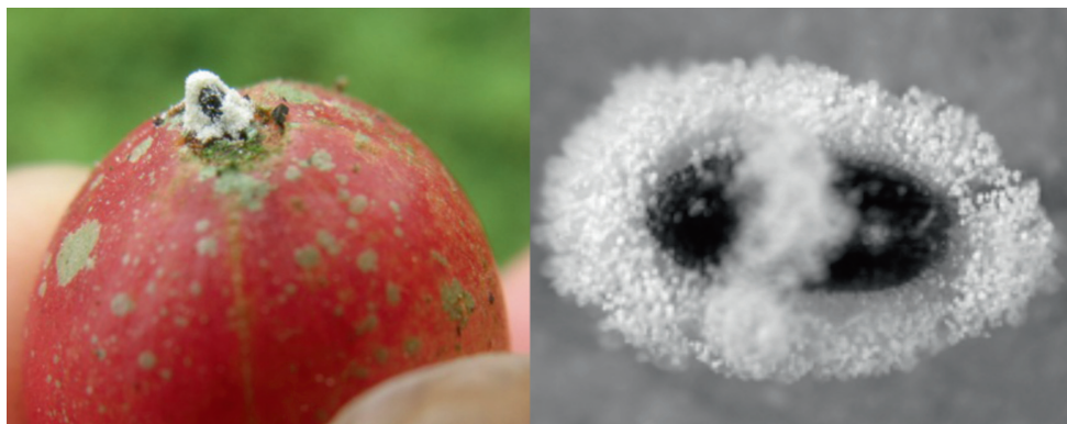
Figure 4. Coffee berry borers infected with the fungal entomopathogen Beauveria bassiana .

Such studies are necessary to determine whether B. bassiana becomes established in the field, causing increased insect mortality in subsequent seasons when compared to plots where it was not sprayed. In addition, it is important to develop cost-effective ways to spray it. One particularly interesting concept involving B. bassiana involves its possible use as a fungal endophyte in biological control programs (see below).