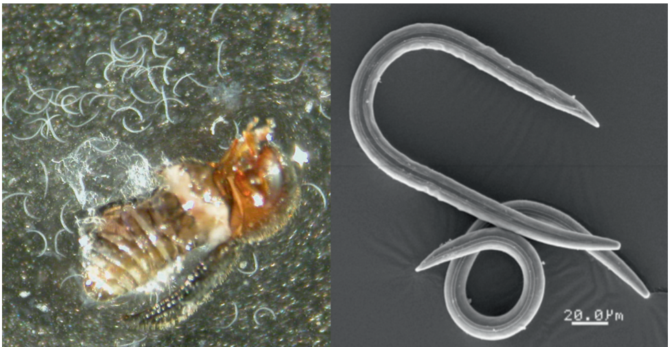
Figure 3. Infective juveniles of Metaparasytlenchus hypothenemi emerging from an infected coffee berry borer (left), and detail of the infective juvenile (right).