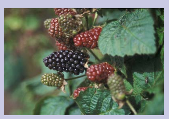
Blackberry - Thornless for Processing Market

'Black Diamond' #1 blackberry in 2003-05 for plant sales!