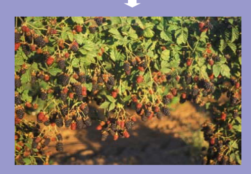
'Wild Treasure' to be released