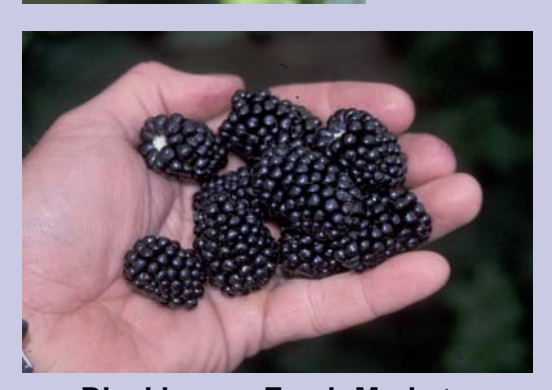
Blackberry - Fresh Market

'Independence' 'Puget Summer' (by WSU in coop with USDA)