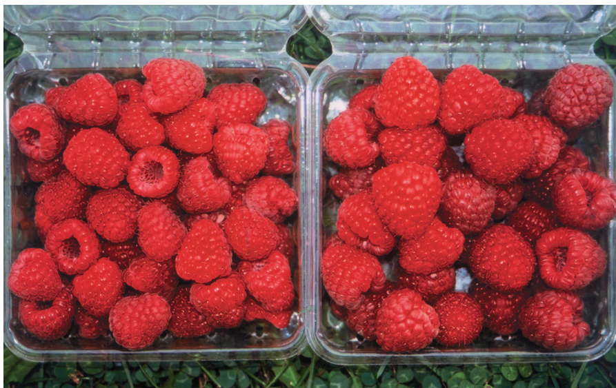
Fig. 1. 'Chinook' (right) and 'Heritage' (left) red raspberries.

There was a significant cultivar × year interaction for yield and fruit weight (Table 1). Over two years, the yield of 'Chinook' was similar to 'Heritage' (Table 1). In addition to being widely grown, 'Heritage' is known for its high yields (Daubeny et al. 1992). While 'Chinook' fruit were similar in weight to 'Heritage' in the first harvest season, they were significantly heavier than those of 'Heritage' in the second year (Table 1). 'Chinook' fruit was rated in our trials as being firmer than 'Heritage' (Table 3), and in growers fields as being firmer than 'Heritage' and 'Autumn Bliss' (G. Richter, pers. comm.). Growers who have packed and shipped 'Chinook' have found that it holds up well, better than 'Autumn Bliss', in clam shell packaging and shipped by air freight transcontinentally, in large part due to its firmness (G. Richter, pers. comm.). The fruit are attractive. The shape is more rounded than in 'Heritage', as indicated by 'Chinook's slightly lower shape score. Drupelets are consistent in size and shape, giving the fruit a very uniform appearance and reflecting good drupelet fertility. The fruit are bright red but