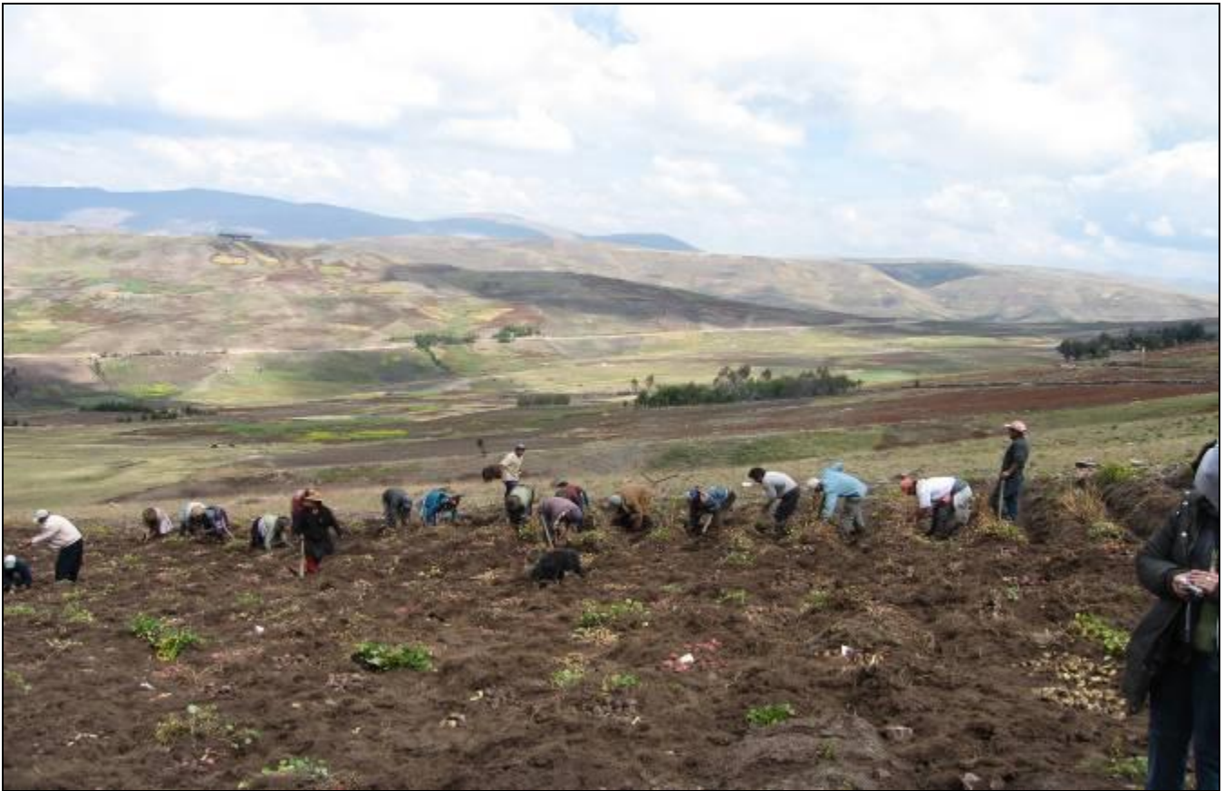
Cooperative research plots in Peru

We produced tubers on plants selected for high nutrients and antioxidants, to which Titanium or Water sprays had been applied pursuant to testing the effect of Ti “hormesis”.