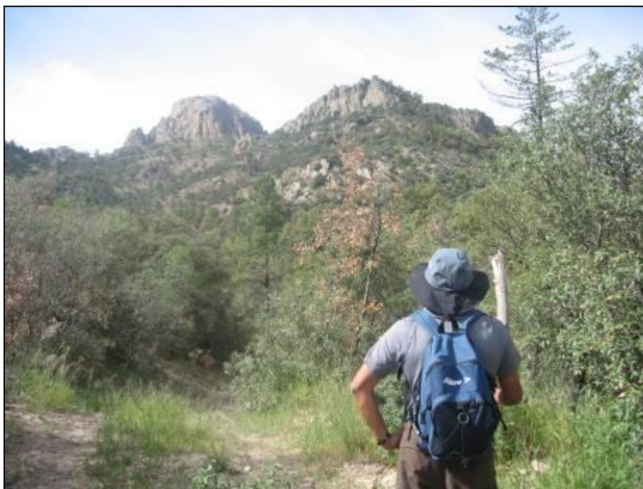
A. del Rio toward Mt. Livermore, TNC preserve, Davis Mts., W Texas