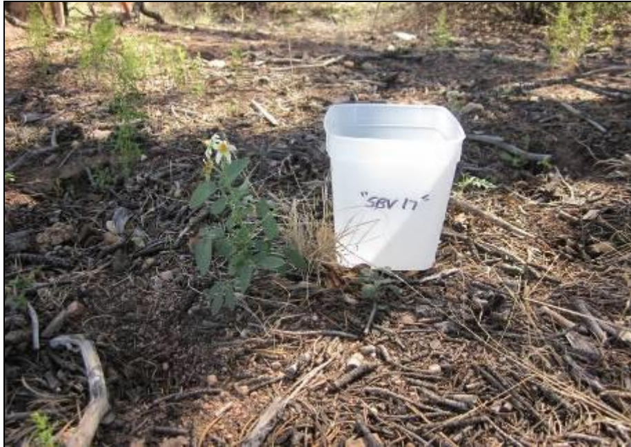
S. jamesii near Silver City, NM

A genebank team re-collected spots known to be highly diverse in AZ, and found some new, totally unreported robust sites for jamesii in NM. The final days were spent collecting the first live fendleri from the TNC land in the Davis Mts of west TX, and also rediscovering jamesii there. This made 32 new accessions for the genebank. We have been offered to lead an expedition accompanied by a film crew in fall 2012.