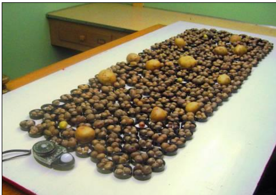
Testing heritability of tuber greening in S. microdontum hybrids

We continued evaluation of microdontum , a species with a remarkable array of useful traits, this year doing work to show that resistance to illuminated tuber greening is highly heritable.