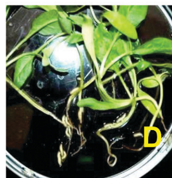
Figure 1. Comparison of sugarbeet root maggot damage (A) on roots of the population from which F1024 was selected, after three cycles of mass selection and (B) on a susceptible adapted hybrid, St. Thomas, ND 2005; (C) root maggot larvae on seedlings from the population that gave rise to F1024 after three cycles of mass selection for maggot resistance and (D) on seedlings of 19961009H2, the root maggot-susceptible parent in the cross from which F1024 was selected.

appeared to be actively feeding 4 h after being placed in the Petri dishes (Fig. 1D). A similar differential response was observed in an earlier comparison of F1010 (PI 535818), a root maggot-susceptible germplasm in the parentage of F1016, with F1016, the resistant parent in the cross from which F1024 was selected (Smigocki et al., 2006).