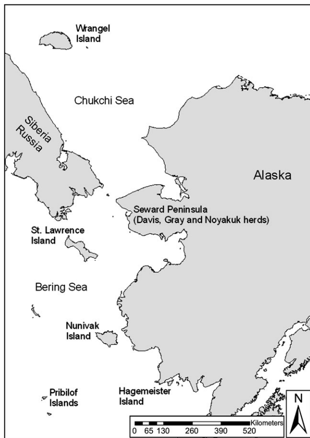
Figure 1. Distribution of reindeer herds in Alaska sampled for genetic analysis.

reindeer (Klein 1980; Reimers 1993; Cronin, Haskell, and Ballard 2003).