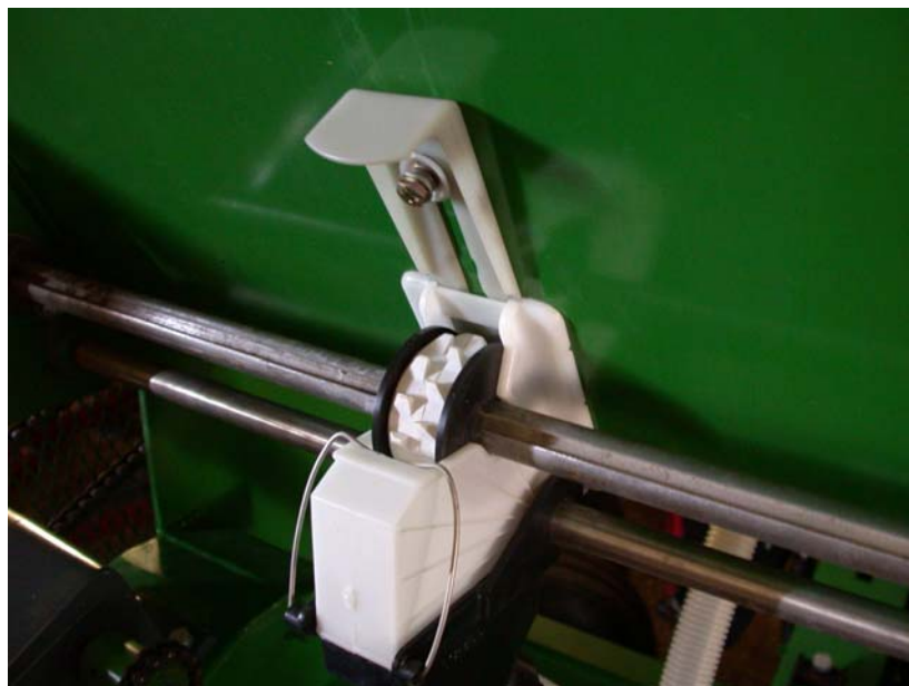
Figure 3. Photograph of the adjustable Amazone metering cup arrangement on the fertilizer box.

Fertilization. Most strip tillage in the Midwest is done in the spring with banded liquid fertilizers, whereas fall tillage and banding dry fertilizers were used in this study. Dry fertilizers are used by almost all growers in the area, and were used in this study to have the same type of fertilizers in both treatments. All fertilizer for the conventionally tilled plots were broadcast whereas, as part of the one pass process, all the strip tilled fertilizer was shanked into the soil in narrow bands and the soil packed to minimize nitrogen volatilization losses as well as reduce nitrogen tie up by residues. In 2003 (for the 2004 crop year), most of the fertilizer appeared to end up in the bottom of the ripper slot, about 8 inches (20 cm) deep. The fertilizer tube and placement shoe on the ripper shank were modified in 2004, and the fertilizer was placed about 7.5 cm (3 in.) below the soil surface although probably about half still ended up near the bottom of the ripper slot for the 2005-2007 seasons.