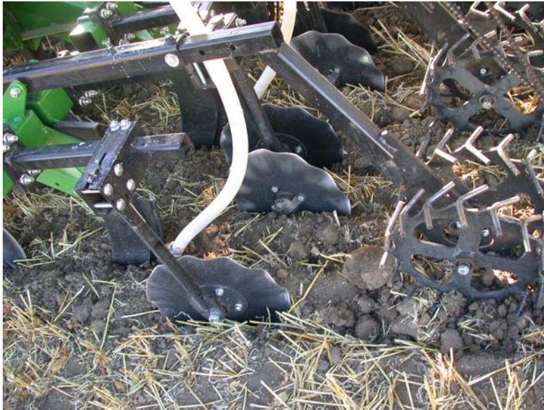
Figure 2. Picture of the strip tiller in operation with the direction of travel to the left.

A divided, gravity feed fertilizer box was added to the strip tiller in 2003 to enable one-pass operation. Application rates are controlled by two ground driven a Model Y1 Zero-Max Adjustable speed drives (Zero-Max, Plymouth, MN; http://www.zero-max.com/products/drives/drivesmain.asp ), which are infinitely adjustable over their operational range. Amazone metering cups (Amazone Farm Machinery Ltd., Brandon, Manitoba, Canada R7A 6N2) are used to meter fertilizer into the tubes. These cups can be used for either seed or fertilizer, and calibration and spot testing showed them to be accurate and repeatable.