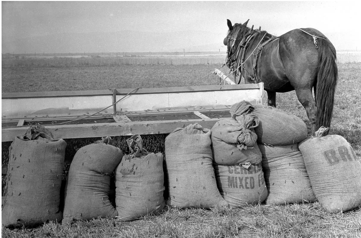
Figure 1. This horse-powered grasshopper-catching machine, in use near St. Ignatius, Montana, in 1917, illustrates an early nonchemical technique for grasshopper control. In 2 hours and 15 minutes, approximately 363 kilograms of grasshoppers were caught with this machine, bagged, and dried for use as winter poultry food. Numerous designs for grasshopper-catching machines, or “hopper dozers,” were developed beginning in the 1870s. Although their effectiveness as a control technique was debated, grasshopper-catching machines were advocated as a means of reducing grasshopper populations in infested fields and providing poultry feed, while avoiding risks to livestock from the use of highly poisonous, arsenic-based baits.

Hewitt and Onsager (1983), for example, estimated economic losses to grasshopper herbivory based on 16 years of data on grasshopper densities, compiled from across the western United States over a period that included both outbreak and nonoutbreak periods. By their calculations, grasshoppers regularly cause the loss of roughly $1.25 billion per year (converted to 2005 dollars) in forage that could potentially be fed on by livestock.