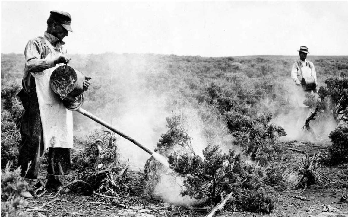
Figure 3. Workers spreading sodium arsenite dust for Mormon cricket control in Sheridan County, Wyoming, in 1935. Nonspecific and highly toxic arsenic-based compounds were the principal toxin used in grasshopper and Mormon cricket control programs from 1885 until the 1940s, when newer, more potent insecticides such as sodium fluosilicate and chlorinated hydrocarbons became widely available. After problems were discovered with the persistence and bioaccumulation of DDT in the 1960s, the organophosphate compound malathion became the most common insecticide used for grasshopper control; it is still used, along with the carbamate carbaryl, for grasshopper control programs in the United States. Over the last few years, Dimilin (diflubenzuron), which functions as a chitin inhibitor and prevents successful molting of insects, has seen increasing use in grasshopper control programs in the western United States because it has fewer nontarget effects on terrestrial insects and vertebrates.

It is time to incorporate significant advances in researchers' understanding of insect population dynamics into grasshopper control. A variety of nonlinear population responses that are important for understanding grasshopper population dynamics, including feedbacks and thresholds, have been discovered in population models. These complex population responses arise from dynamic density-dependent and frequency-dependent food web interactions (Schmitz 1998, Danner and Joern 2004) and predict a range of indirect feedback relationships that can greatly modify direct responses. Density dependence results from limited resource (e.g., food) availability within a trophic level, or from interactions with natural enemies between trophic levels, and these interactions limit grasshopper populations. Chemical control necessarily disrupts or otherwise affects these relationships in unpredictable ways. In the simplest case, other arthropods besides the target may also be killed, freeing up resources or reduc-