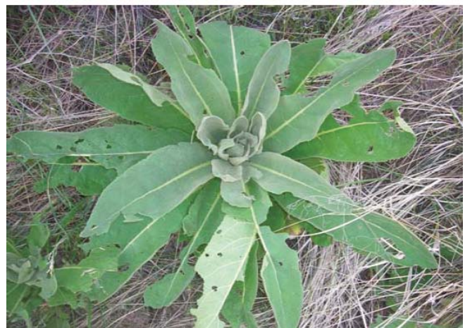
Figure 2. Mullein ( Verbascum thapsus ) rosettes in their native range (Switzerland, top picture) are typically heavily damaged by herbivores and diseases whereas those in their introduced range (Colorado, bottom picture) receive much lower levels of damage.