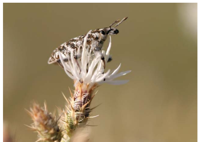
Figure 3. The root-feeding weevil, Cyphocleonus achates , on a diffuse knapweed ( Centaurea diffusa ) flower. C. achates is one of several biological control agents that can reduce populations of diffuse and spotted knapweed ( Centaurea stoebe ).