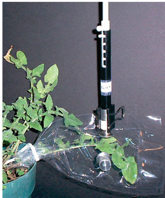
Figure 2. Volatile analysis of C. solstitialis using collection bag and SPME.

bag/air volatiles. The internal standard 1-decanol (3.7 \mu\text{g} in 0.1 mL of water) was injected into each sealed bag, and the resulting relative abundances for each run were normalized to the amount of 1-decanol (3.7 \mu\text{g} ).