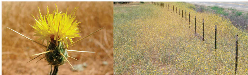
Figure 1. Detailed picture of Centaurea solstitialis showing the inch-long spines, and a field overrun with C. solstitialis .

The volatile compositions of C. solstitialis (18, 19) and C. cineraria (20) have previously been investigated, and the volatiles from C. solstitialis were compared to other plants in efforts to determine chemical cues for biocontrol purposes (21, 22). These investigations, however, did not perform direct comparison of the Centaurea species with reported semiochemical behavior of a biocontrol candidate, such as Ce. basicorne . Additionally, these previous studies evaluated flower buds, stems, and/or leaves of mature plants, yet Ce. basicorne attacks plants in the rosette stage, which lacks stems or flowers and may therefore exhibit different types and/or quantities of VOCs. Herein we report on the in situ volatile collection, analysis, and comparison of VOCs from rosette leaves of these three Centaurea species and discuss their relationship to the prospective biological control agent Ce. basicorne . The leaves of each plant were measured with and without three types of damage to determine the effect on VOCs. This is the first known report of the volatile composition of C. cyanus .