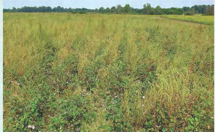
Figure 4. Glyphosate-resistant Palmer amaranth infesting Georgia cotton.

Alabama requirements additionally state that "all crops in rotation must currently be in a conservation tillage system." Tennessee requirements include that an herbicide resistance CAP be developed. Alabama and Tennessee practices require, for minimum payment, herbicide mode of action rotation, control of weeds after crop harvest, and maintenance or enhancement of current conservation practices. In addition to these requirements, producers are expected to implement scouting, mechanically remove HR weeds to prevent seed production, minimize in-row residue disturbance, use shielded sprayers, increase crop residue, and clean equipment. To receive the highest payment, producers are required to also implement a high-residue cover crop system and, in Alabama, use a mechanical roller that flattens the cover crop and facilitates planting. A sod-based rotation option, in which perennial forage crops are rotated with agronomic crops, is available in Tennessee.