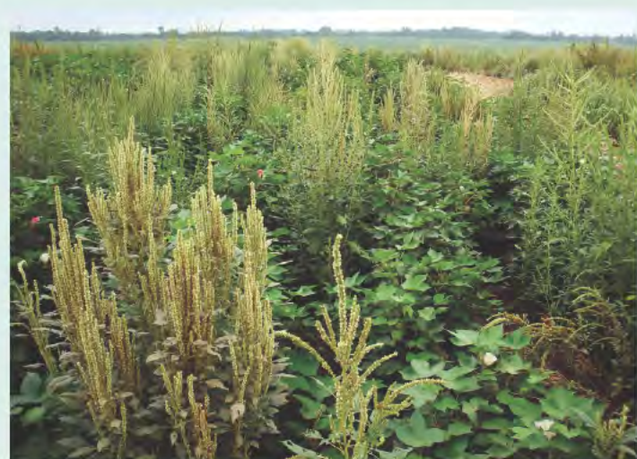
Figure 6. Palmer amaranth infestation with strip tillage.