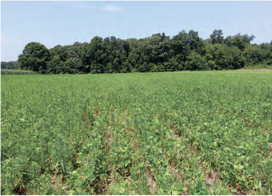
Figure 3. Glyphosate-resistant horseweed in a Tennessee conservation tillage field.

complexity in non-HR crops, GR crops utilizing glyphosate supported the wide-scale grower adoption of conservation tillage. With the evolution of HR weeds and the resultant inability to maintain weed control, however, the continued inclusion of conservation tillage systems is threatened.