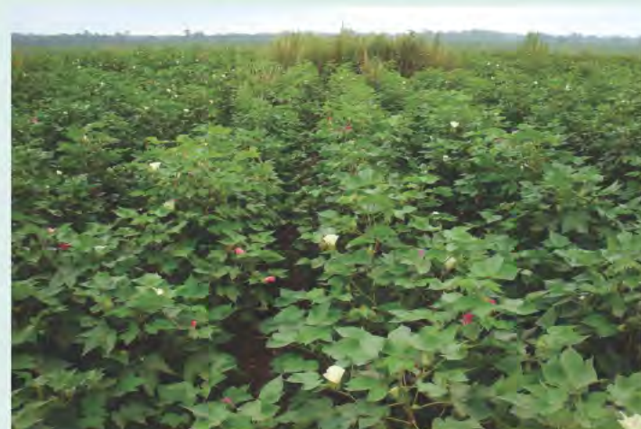
Figure 5. Decreased Palmer amaranth infestation in Georgia cotton following inversion tillage and mulching. The nontreated control is in the background.