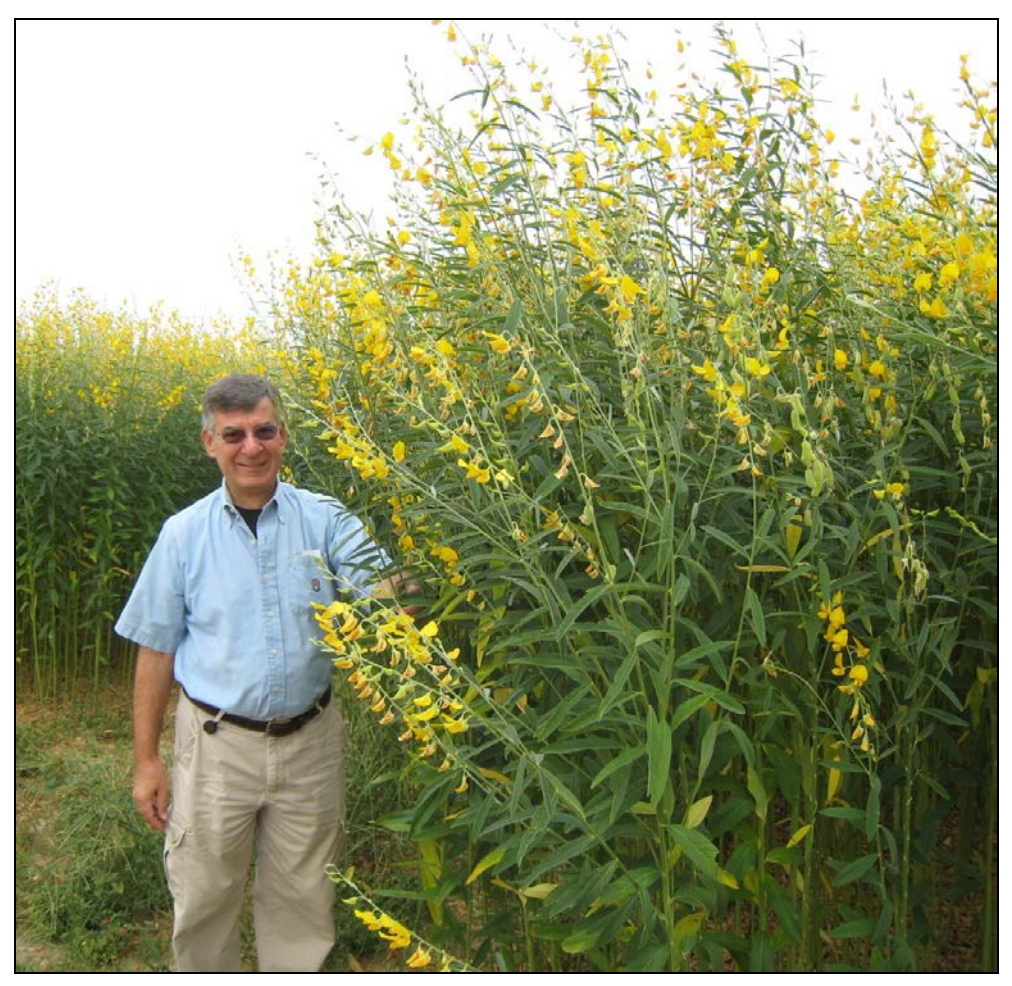
Fig. 2. The vigorous growth of sunn hemp cultivars developed at Auburn University, Alabama, can be seen here, 70 days after planting.