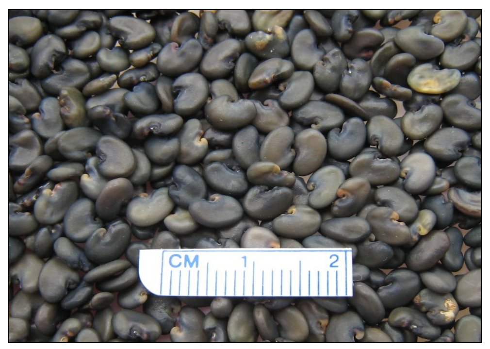
Fig. 3. Sunn hemp seed production can yield 450 to 1000 kg of seed per hectare.

production typically requires a longer season than can be achieved before winter conditions in temperate regions (Li et al. 2009)(sunn hemp seed pictured in Figure 3). The lack of seed production outside of tropical and subtropical climates severely limits seed availability to producers in cooler climates. Moreover, with seed costs ranging from $90 to $130 (US) per hectare, implementation of C. juncea as a cover crop can be an expensive task for growers (Li et al. 2009; Petcher 2009).