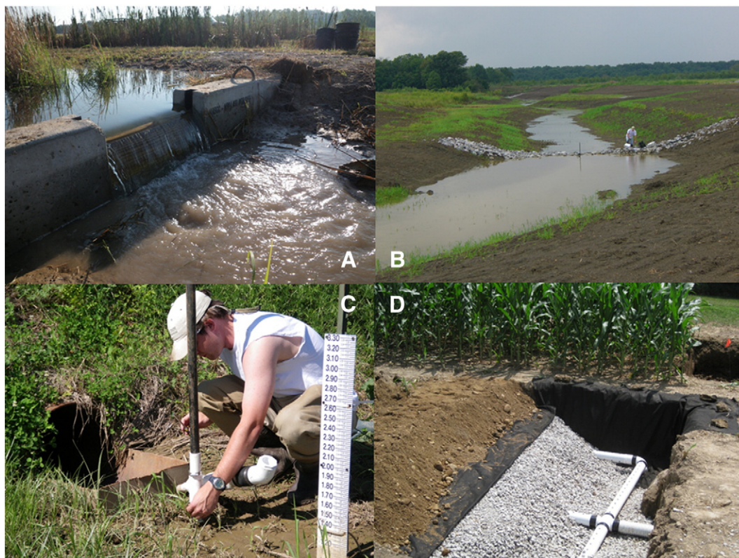
Fig. 2. Photographs of various downstream management practices advocated for P management on agricultural landscapes. A) Low-grade weir (concrete and modular); B) Low-grade weir (rip-rap and earthen berm); C) Slotted pipe and pad (edge-of-field); and D) Blind inlet or French drain.

Chemical treatment of drainage waters at the point of entry (i.e., end of tile) into the stream, edge-of-field, or within the stream (i.e., instream filtering) itself has gained much attention. In situ approaches being investigated and implemented to address P in the UMRB, GLW, and Chesapeake Bay include end-of-tile filtering (King et al., 2010), and in-stream treatments (Bryant et al., 2012; Penn et al., 2010). Alternative stream design may also offer some ability to address excess P (Roley et al., 2012). Removal of P by industrial byproducts such as fly ash, bone char, mine