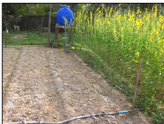
Fig. 3. Conventional tilled plots (left) and conservation agriculture plot (right) with Crotalaria juncea cover crop in Siem Reap, Cambodia