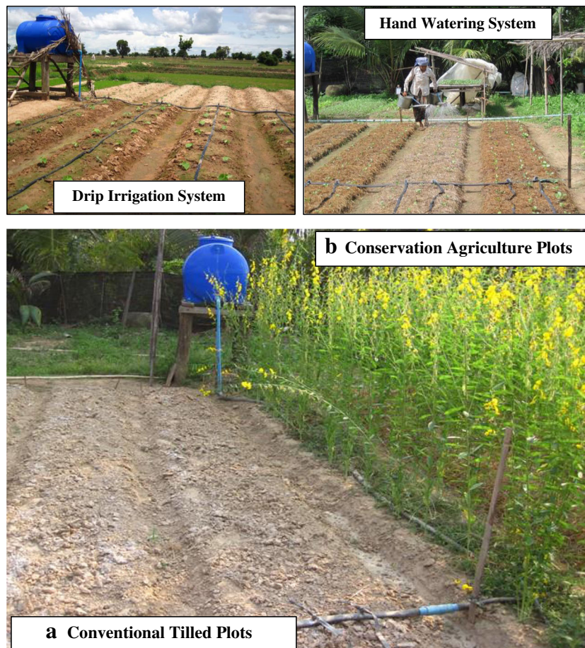
Fig. 1 Conventional tilled plots (a) and conservation agriculture (b) with sunn hemp ( Crotalaria juncea L.) cover crop under drip irrigation system and/or hand watering system in Siem Reap, Cambodia

Yield improvements have been reported on several crops grown under conservation agriculture in several parts of the world. For instance, Thierfelder et al. (2015) found greater corn ( Zea mays L.) yields under conservation agriculture over conventional tillage in southern Africa. Yields of maize or other crops have been reported between conservation agriculture and tillage systems not only in African countries but also in North America, Latin America, and Asia (Kassam et al. 2009; Farooq et al., 2011). Among other things, the main factors attributed to better yields are improved soil physical conditions (i.e., enhanced infiltration and retention of soil moisture) and better fertility status of the soils in the long