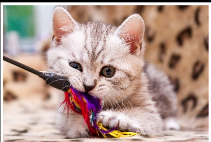
Animal: Cats Behavior: Playing

Cats lick themselves to keep their fur clean. This is known as grooming.