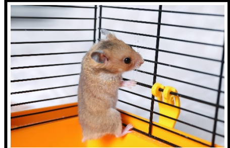
Animal: Rats, mice, and hamsters (pictured) Behavior: Climbing

One way that birds move and relocate is by flying. To fly, birds flap their wings back and forth which helps them move through the air.