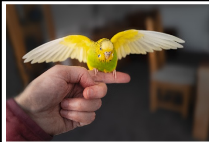
Animal: Birds Behavior: Flying

Cats will perform play behavior by running around or playing with toys. For example, you can shine a laser on the wall or ground and let them chase it.