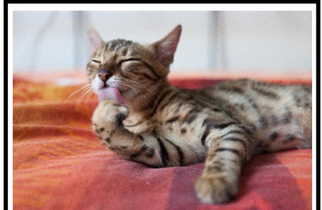
Animal: Cats Behavior: Grooming

Dogs will pant by opening their mouth, sticking their tongue out, and breathing faster. Dogs may pant because they're hot or nervous in different situations like storms.