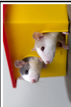
Animal: Rats (pictured), mice, and hamsters Behavior: Playing

Rats, mice, and hamsters climb to exercise and explore their environment. They will climb on their cages or structures like ladders and tubes.