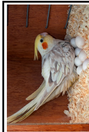
Animal: Birds Behavior: Brooding

Most rats, mice, and hamsters are social animals meaning they like having a friend around. They often like to play, chase and groom each other.