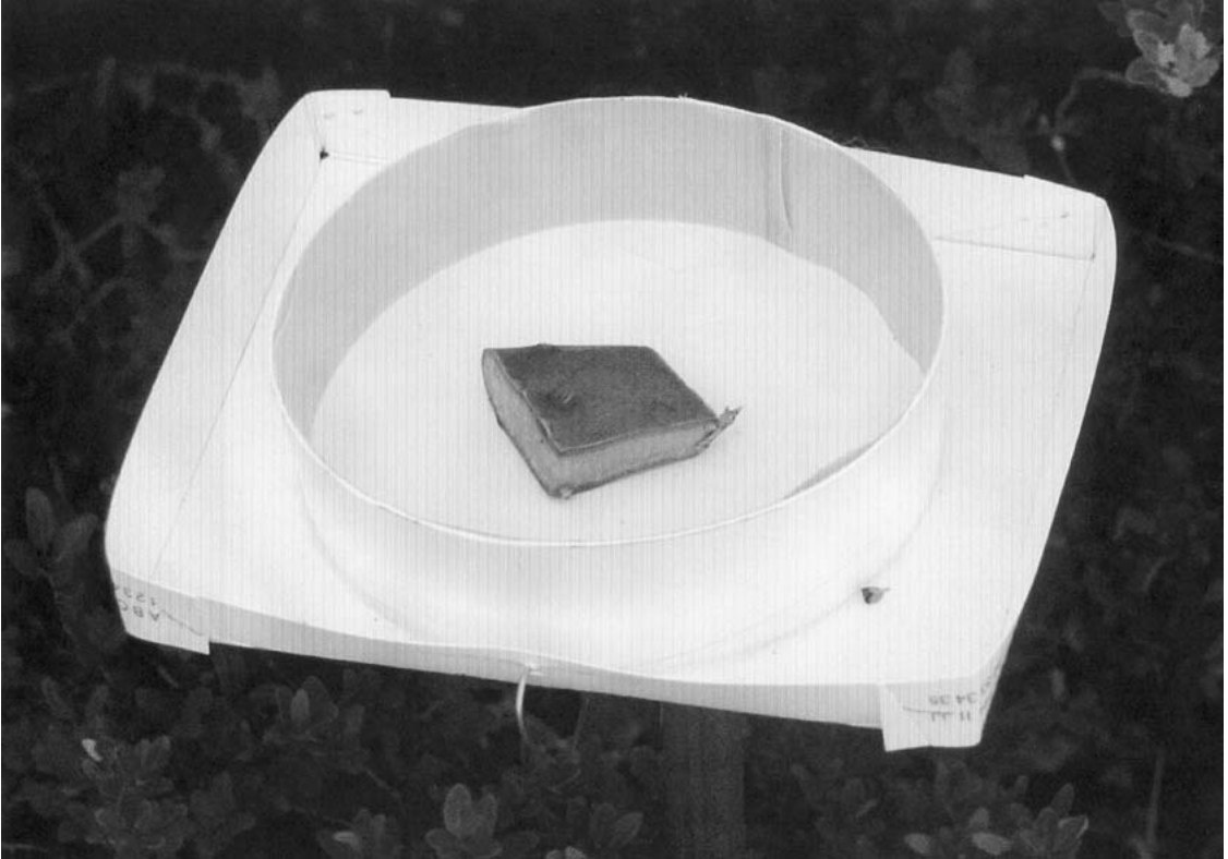
Fig. 1. Small mating table used in determining courtship and mating behaviors at St. Marks National Wildlife Refuge (7 July 2003) and Alligator Point, FL (8 July 2003), and determining precise timing of mating events at Alligator Point (15-18 July 2003).

Mating tables were set-up in the same fashion for each set of observations. A small ( 2 \times 2 cm) section of O. stricta was placed in the middle of the mating arena of each individual table. One, clipped-wing, virgin female C. cactorum was released into each arena. In communal tables, several cladodes of fresh O. stricta were placed inside the arena and 7-12 clipped-wing females were placed in the center of each mating arena. Time of female deployment varied for each experiment. All times reported are in Eastern Daylight Savings Time on a 24-hour atomic clock.